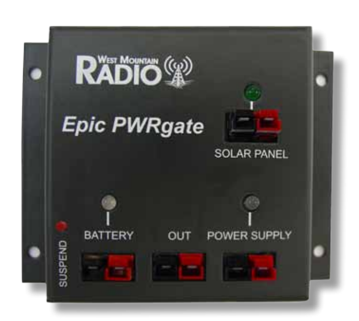
See Page 5 for details!