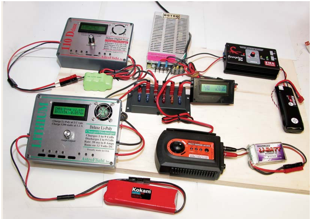
This workbench hints at the future of electric flight: the 5-socket model 4005 RIGrunner is at stage center, and is powered by an Astro Flight power source. An Astro Whattmeter specifies volts, amps, watts and amp-hours delivered to the RIGrunner.

The RIGrunner has a 40A ceiling, so if you are using an auto battery as a source, use a