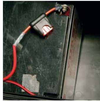
A 40A fuse has been spliced into the power cable near the battery terminal.

The RIGrunner is attractively designed, rugged and easy to use. It saves time, pro-