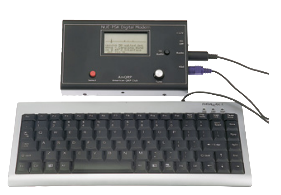
The NUE-PSK modem sends and receives PSK-31, with more modes to come, without requiring a computer. Any PS/2 keyboard can be used. The NUE-PSK is shown here with the lightweight, portable Parallax Mini-Keyboard, which is available from retailers for $19.95 (or directly from Parallax at www.parallax.com).

modem sits a new and inexpensive 16-bit microcontroller from Microchip called the dsPIC33F. See Figure 1. This device combines a standard control processor together with a computational powerhouse digital signal processor. While the conventional control processor instructions handle the display and keyboard I/O, the DSP instructions are what actually perform the complex PSK31 demodulation, thus allowing the NUE-PSK modem to be the first economic solution for digital modem operation without the aid of a PC sound card.